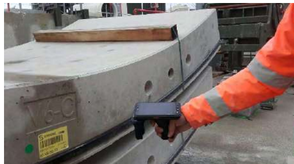
Identification of the archestones of Grand Paris tunnels