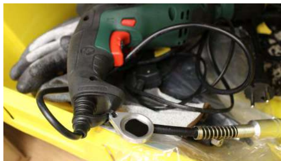
Tracking of tools