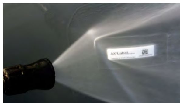
RFID labels resistant to high pressure washing