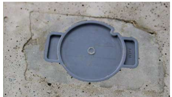
Identification and maintenance of railway sleepers