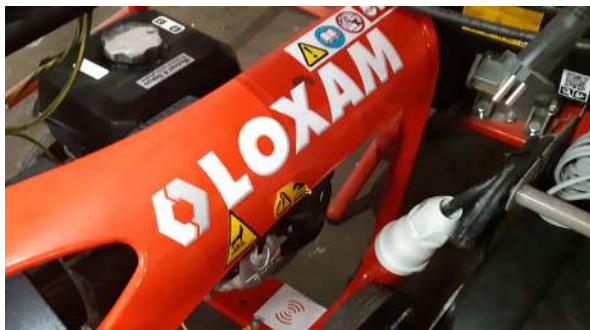
Management of rental material