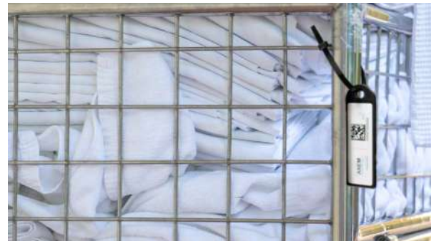
Tracking of trolleys