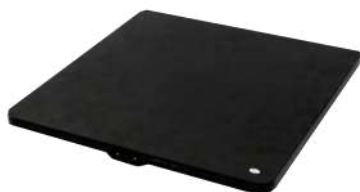
V4.0 Non contractual document