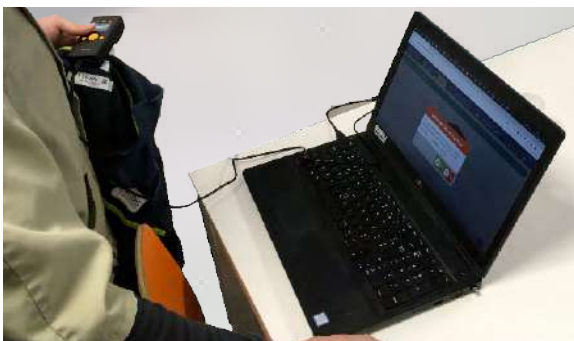
Inventory of flat linen