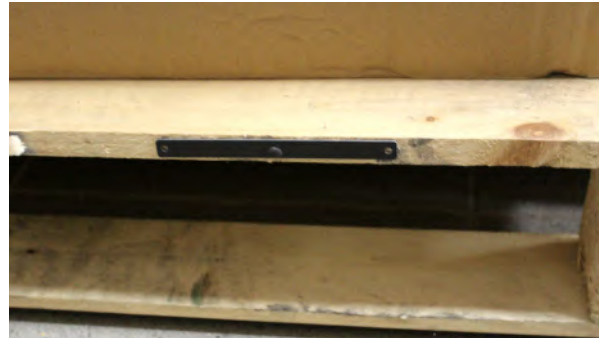
Identification of pallets