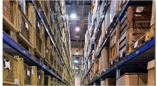
In-store stock traceability