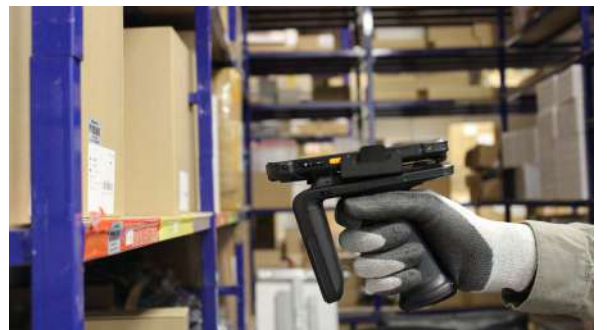
Inventory on shelves