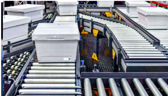
Identification of shuttle boxes on conveyors