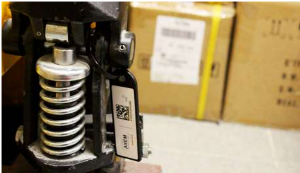
Traceability of machines