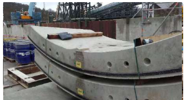
Management of maintenance operations