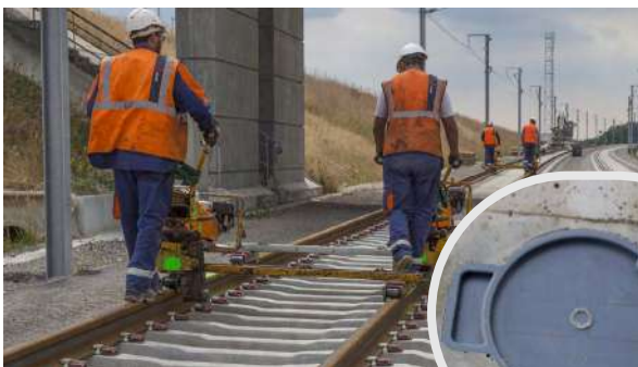
Identification and maintenance of railway sleepers