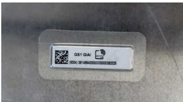
Identification of external metal parts