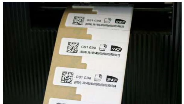
Printing and encoding according to GS1 standards