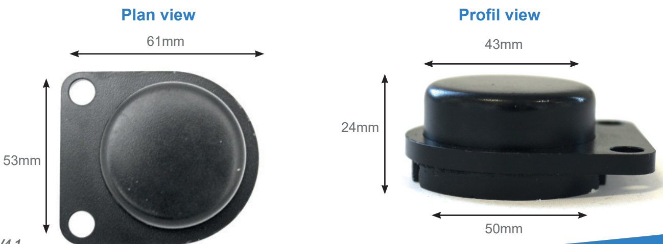
V4.1 Non-contractual datasheet

End result - the Armored 400c tag will FUNCTION at extreme temperatures.