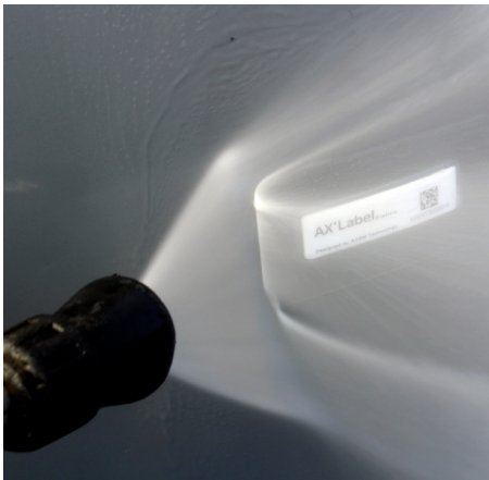
Pressure washing resistance