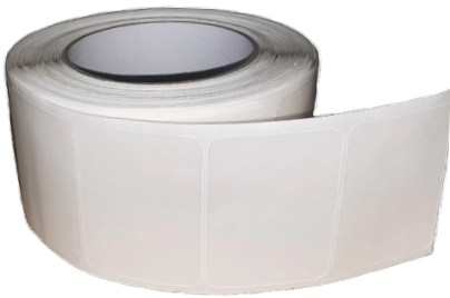
Single roll of Protect +