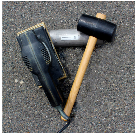
Abrasion and shocks resistance