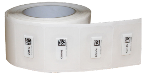
Roll of protect & AX'Label assembled