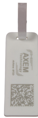
With white plastic cable tie